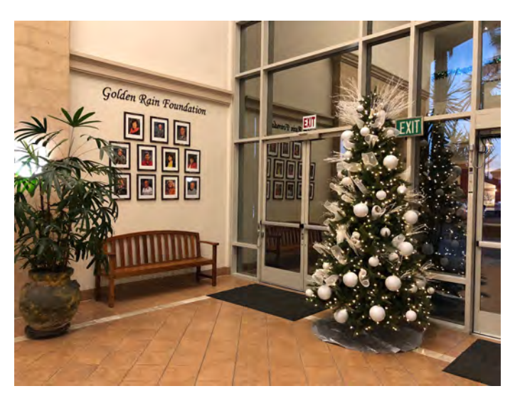
The Community Center lobby is decked out for the Holidays. Come by and get a cookie in Resident Services!