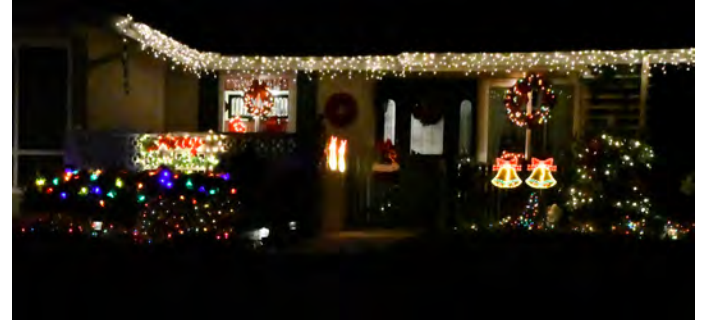
Holiday Lights in the Village.